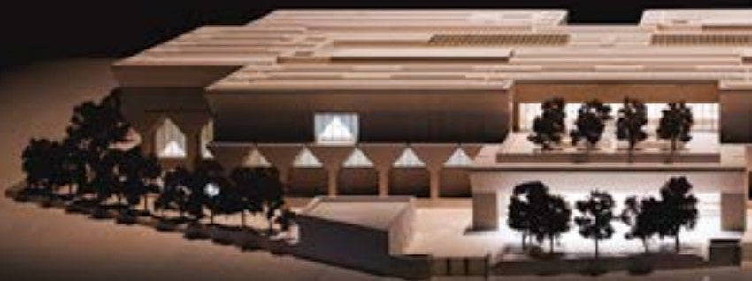
Architectural model by Adjaye Associates for Kiran Nadar Museum of Art at 18th Biennale Architettura, Venice 2023.