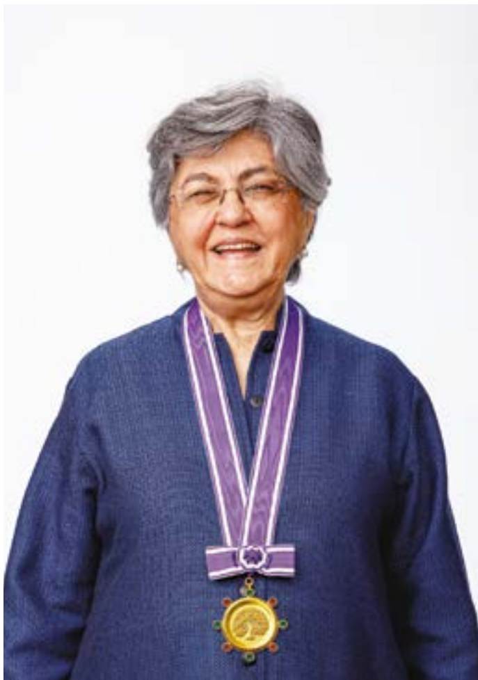
Nalini Malani, Kyoto Prize – Arts and Philosophy, 2023